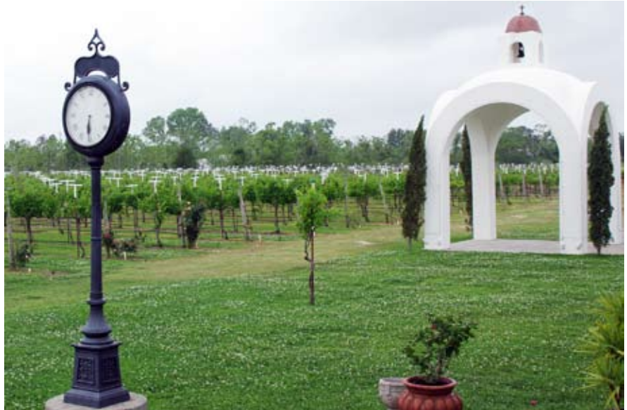
Vineyard at Haak Vineyard and Winery, Santa Fe, Texas provides a perfect setting for proposals, weddings, events and relaxing with a glass of wine.

We discovered the Texan spirit and determination. Both small and large Texas wineries face many of the same difficulties. Pierce's disease, early spring frosts and freezes, hurricanes and flooding all take a toll on wineries and vineyards. Probably the most devastating destruction