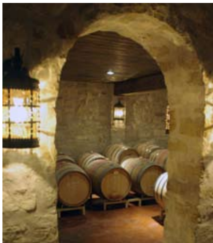
Barrel room at Driftwood Vineyards, Driftwood, Texas

When wineries need to source grapes, they try to source from Texas. When this is