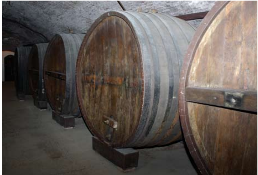
Brotherhood, America's Oldest Winery also houses some of the oldest wine barrels.

Our next trip led us to Warwick Valley Winery and Distillery. This is a larger production facility that produces 20,000 cases of hard cider. In addition to wines, Warwick Valley also uses their distillery to produce many distilled products.