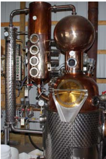
Demarest Winery uses a wood fueled still to produce a large variety of distilled products.

A short walk from the tasting room leads to the distillery. A wood fired still gleams in the light. Although quiet on the day of our visit, the still is used to produce alcohol used in a variety of products sold in the tasting room.