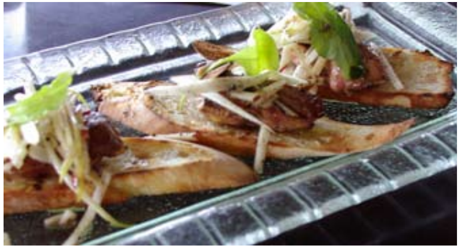
Callaway Winery's restaurant offers gourmet dining outside. Enjoy great meals and wine.