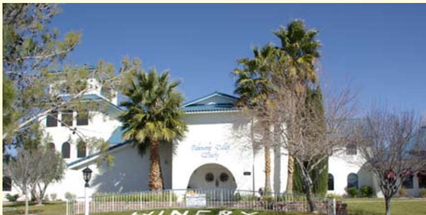
Vineyards, gardens and gazebos make Pahrump Valley Winery a pleasant escape from the Vegas strip.