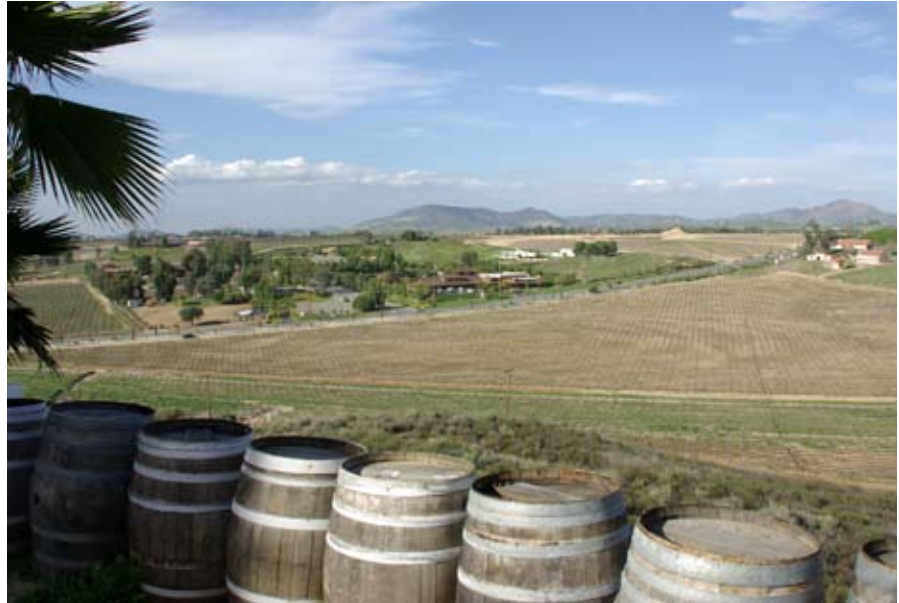
View of Temecula wine country from Bella Vista Winery.

Temecula Valley is about an hour’s drive from San Diego and is located within an easy ninety-minute drive from Los Angeles. With about 20 million people within the southern California area, it is difficult to believe that many people do not know about the wineries in Temecula. Many of the wineries are located on Rancho California Road and within sight of each other. Others are only 15 to 20 minutes away. If you live outside of this