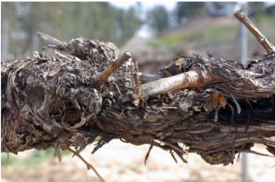
Old vines weeping, a sign that spring will come soon.