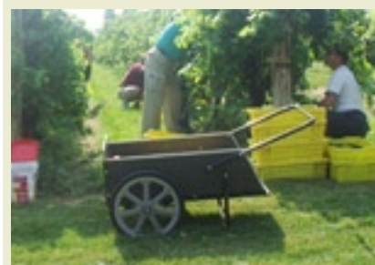
Volunteers harvesting grapes at Basigini Winery in Maryland

Watch for Wine Trail Traveler's October Newsletter with more about harvesting grapes.