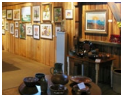
Art Gallery at Friday's Creek Winery in Maryland

Many winery tasting rooms sell local artists creations from their tasting room. Local artists submit a portfolio of their work to Pentamere Winery in Michigan. Chosen artists have their work displayed for several weeks. The tasting room is booked for several months in advance. The second floor of Friday's Creek winery, in Maryland, is an art gallery. Local artists provide paintings, pottery and sculptures for purchase.