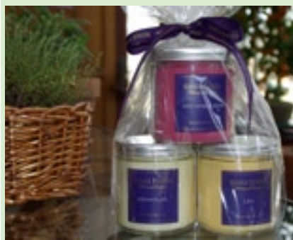
Wine scented candles at Kluge Estate Winery, Virginia

Candles are a popular gifts at wineries. Many of the candles have scents of popular wine aromas. Folly Hills Winery in Pennsylvania and Kluge Estates in Virginia have nice selections of candles.