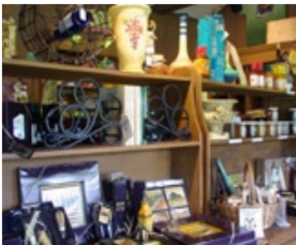
Gift items at the Wintergreen Winery tasting room

Searching for a wedding gift? Perhaps champagne glasses would be perfect for the happy couple. Look for winery-recommended