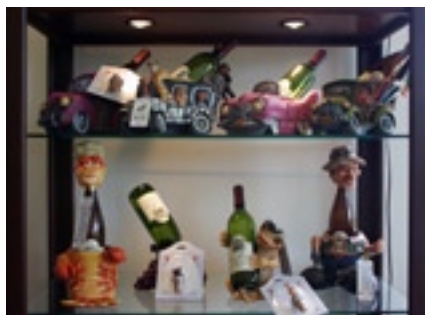
Just a few of the different wine bottle holders available at Clover Hill Winery in Pennsylvania

From photography, paintings, sculptures, to pottery an astute shopper can find the right gift often at reasonable prices at winery tasting rooms. Clover Hill Winery in Pennsylvania offers many unique gifts. They have a wide assortment of different wine bottle holders and hand etched Romanian glassware. The next time you visit a winery tasting room, amble through the room looking for unique gift items. T.S.