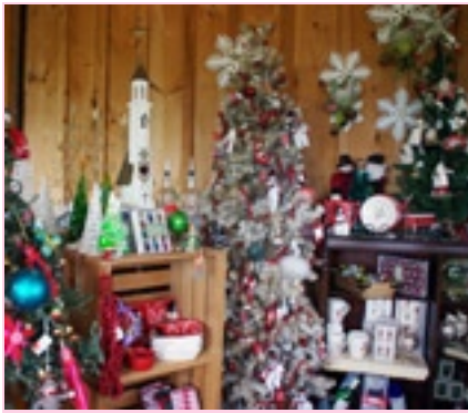
Second floor of gift shop at Bully Hill Vineyards, in New York, has holiday gifts available throughout the year.