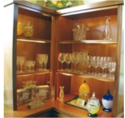
Crystal display at Trentadue Winery, California

Perhaps a friend would appreciate a certificate to Wintergreen Winery near Nellysford, Virginia. Wintergreen loans picnic baskets for food purchased in the tasting room. Visitors can purchase tasty gourmet treats, cheeses and drinks, and enjoy them under a lovely overhanging willow tree or along a